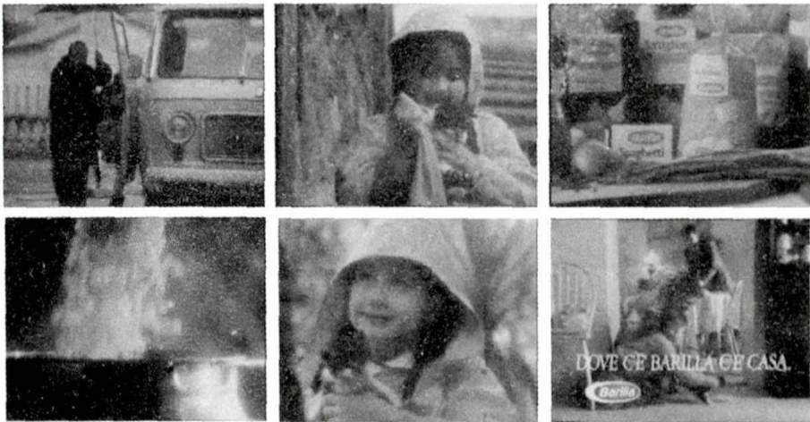
Figure 3 Commercial The Little Girl with the Yellow Raincoat, 1987

while waiting for her husband (who will appear shortly afterwards) and her daughter, is cooking pasta. The camera then moves to the clock and the worried expression of the two parents; it is almost one o'clock in the afternoon (Italian lunch time!) and their daughter has not returned home from school. Along the way, in fact, the child finds a lost kitten and she stops to put it under her raincoat and take it home with her. Suddenly, the man sees the daughter from the kitchen window and he goes with his wife to the door. Here their worried and almost reproachful expression immediately makes room for a moment of hilarity; the little girl extracts the kitten from the raincoat and smiles looking at the mother, who, returning the smile and inviting them to enter. The commercial then closes with the scene of the woman placing on the ground a bowl of milk to feed the little cat and then hugging her daughter, while in the background the father brings to the table a dish full of pasta. Finally the tagline “Where there is Barilla there is a home”, reiterated by the voice-over, appears on the screen, followed by the logo Barilla (updated, but always shaped to make reference to the egg).