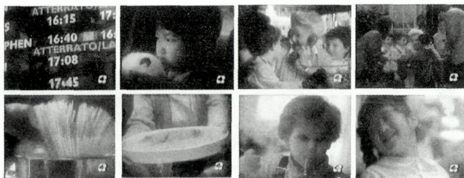
Figure 5 Commercial Pasta and Conviviality , 1992

of those basic values identified in the previous case: conviviality, sharing and joy of staying together. Such values are strong enough to erase not only the physical distance, as we saw in the case of fusilli , but also cultural differences.