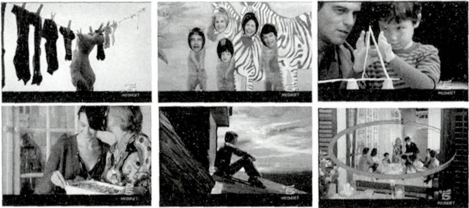
Figure 6 Family, friendship, and joy of staying together , 2009 (© Barilla).

mine]) In the mean time, a series of scenes of familiar hilarity among more or less young people appear on the screen, leading to the last image, which depicts these characters all gathered around a table and the dish of pasta still steaming that the head of the family is putting on it. Then a red line surrounds them, stressing the importance of the friendly, relaxed atmosphere that has been created and announcing at the same time the logo Barilla, which will appear shortly afterwards.