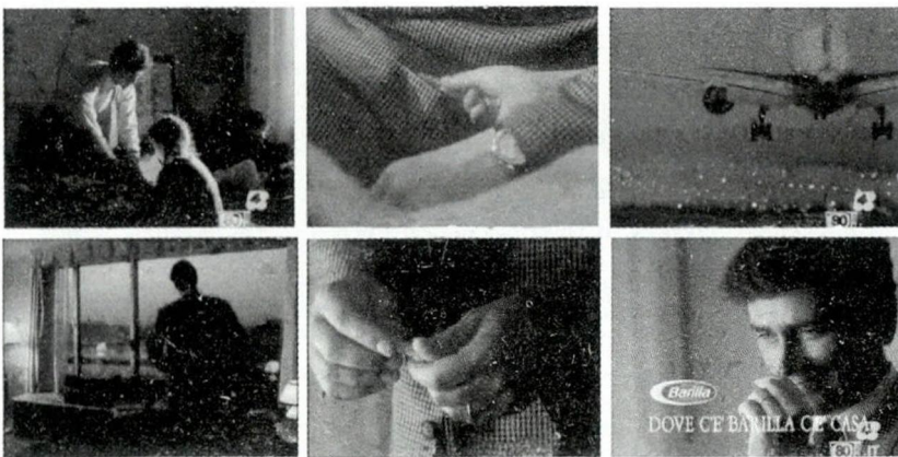
Figure 4 Commercial Travels and Fusilli, 1988

A man, surrounded by his children, is packing his case (so that we can understand that in a short he will leave). Then the product appears, as the voice-over says: “Fusilli Barilla. Made to tie together the finest flavours of your kitchen” (Barilla, 1988 [translation of mine]). So the camera moves back to the man and his family, shot while eating together and then on their way to the airport. When they are in the car, his daughter furtively enters fusilli (which is a particular type of pasta) in his jacket pocket, then giving a smile of complicity to her brother. After saying goodbye to his family, the man appears alone in a hotel room, while sadly looking out of the window. This is the moment when, finding fusilli in his pocket, he smiles, smelling the piece of pasta. Then the voice-over—as always, with the logo in superimposed—comes in to say: “Where there is Barilla there is a home.”